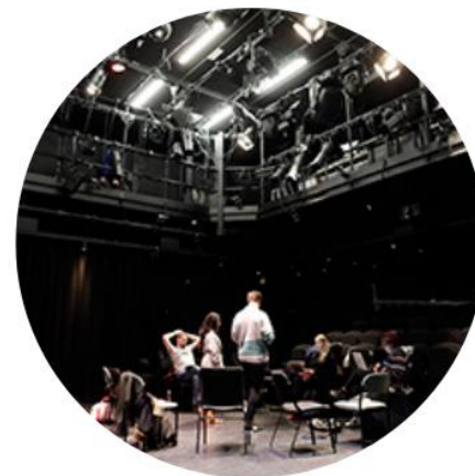
Rehearsal rooms + 2 studios