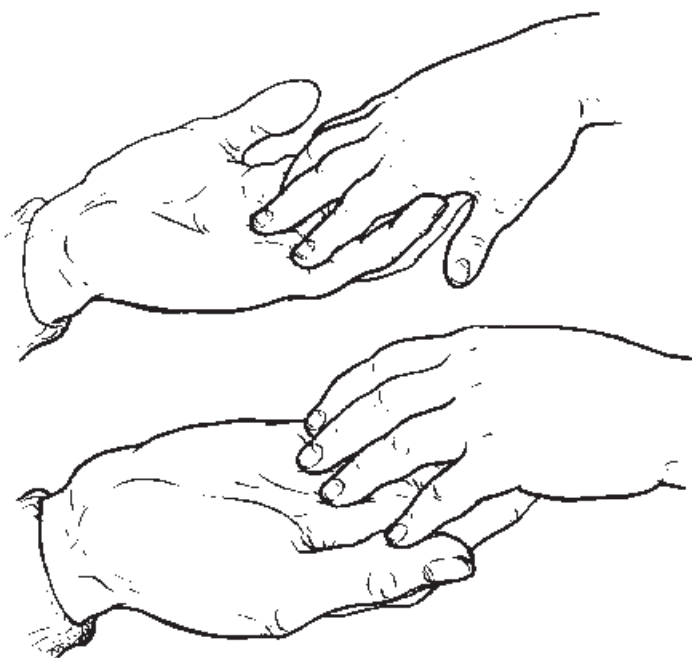
Figure 2. The teacher's hands are underneath —available for the child to use as tools.