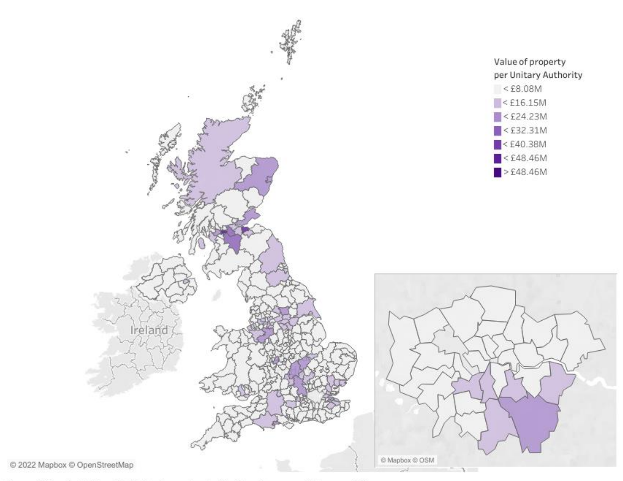
Map 1: Location and value of completed mortgages supported by the 2021 mortgage guarantee scheme from April 2021 to December 2021, by local authority, UK