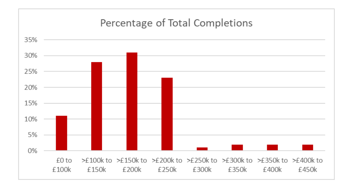
Chart 1: Property completions from December 2015 to 31 December 2021, by property value.