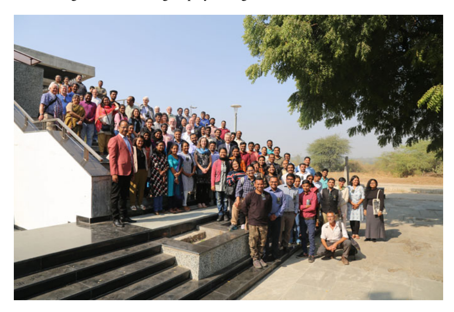
Delegates during the workshop on 'History, Science and Technology of Ancient Indian Glass', twenty-first January 2019 at IIT Gandhinagar

support for a few international travels, and to Banaras Beads Ltd. for logistic support for the live glass bead-making display during the conference.