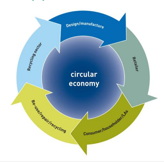
Figure 2. A Circular Economy Cycle

The circular economy can be defined as "an alternative to a traditional linear economy (make, use, dispose) in which we keep resources in use for as long as possible, extract the maximum value from them while in use, then recover and regenerate products and materials at the end of each service life" (WRAP 2018a). Similarly, the circular economy model advances economic activity that builds and rebuilds overall system health rather than just focusing on maximizing economic returns (MacArthur Foundation 2018). Figure 2 shows one simple portrayal of a circular economy approach.