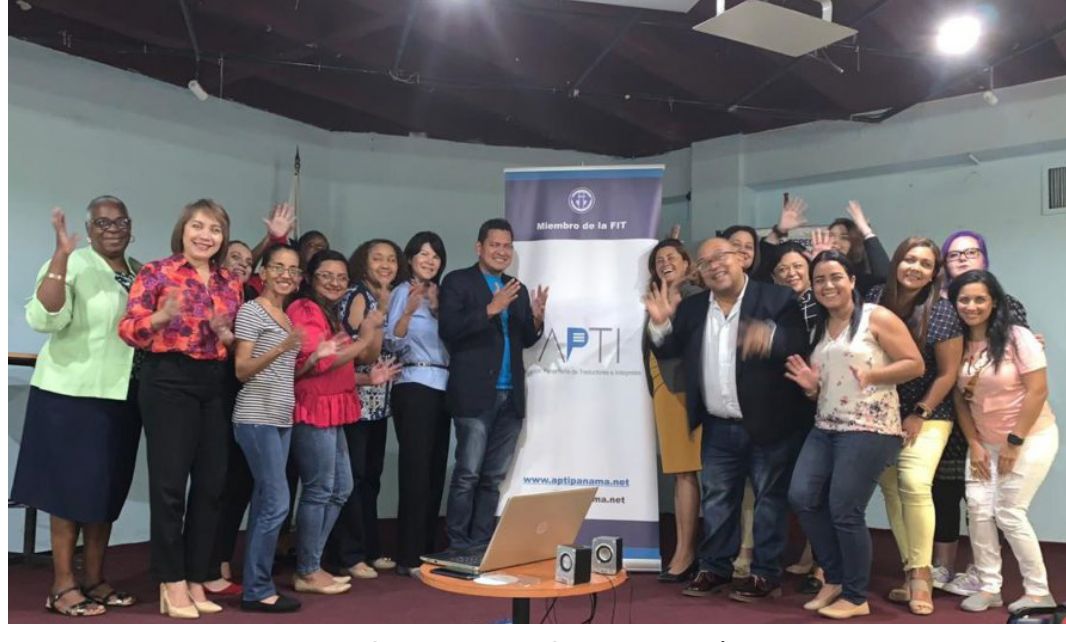
APTI Sign Language Seminar attendees

To strengthen professional standards in Panama, APTI has taken the lead in helping