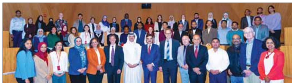
Participants in the symposium.