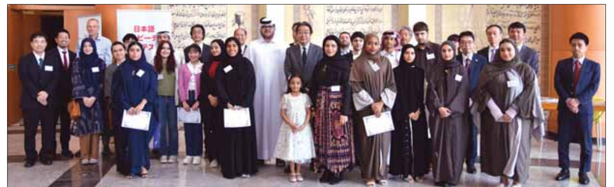
Japanese ambassador Satoshi Maeda with the winners and other participants.

WiredScore has certified more than 800mn sqft of prime real estate, impacting more than 8mn people across 36 countries. Recent research shows that technologically enabled buildings achieve up to 15% higher rental values in commercial real estate, lower vacancy rates, and energy savings of up to 25%.