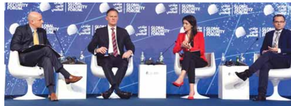
Participants at the discussion.