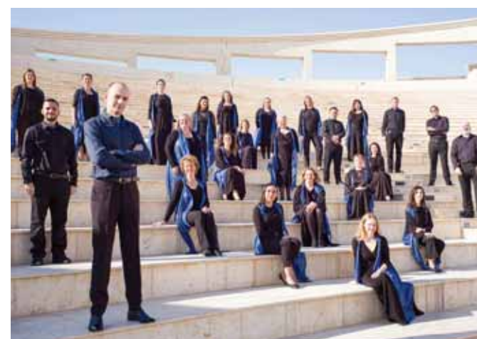
The Qatar Concert Choir

The performance includes guest appearances from the French soprano Fabienne Conrad, percussionist George Oro, and Qatar's Cinemoon Ensemble