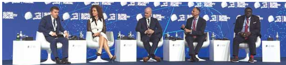
The session in progress.