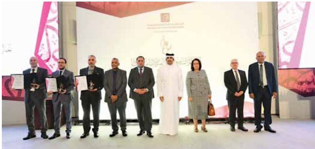
HE the Minister of Culture Sheikh Abdulrahman bin Hamad al-Thani with officials and winners of the Arab Award.