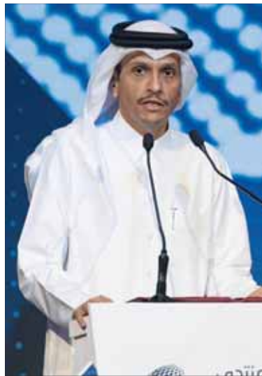
HE the Prime Minister and Minister of Foreign Affairs Sheikh Mohamed bin Abdulrahman bin Jassim al-Thani inaugurated yesterday the 5th Global Security Forum, held under the theme "Reshaping the Global Order: Conflict, Crises, and Co-operation" at the Sheraton Doha Hotel.

The opening was attended by a number of sheikhs, ministers and heads of participating delegations, as well as a number of ambassadors accredited to the state, senior officials, experts and academics specialised in global security issues, and journalists.