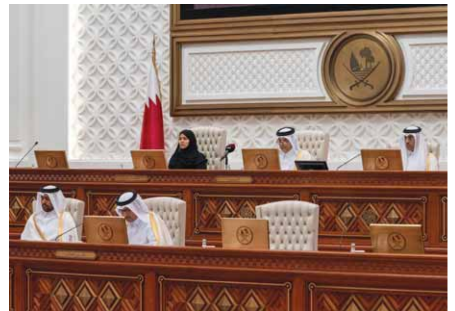
The Shura Council meeting in progress.

HE Dr al-Marri also explained that the draft law grants the Minister of Labour regulatory powers to implement the law by