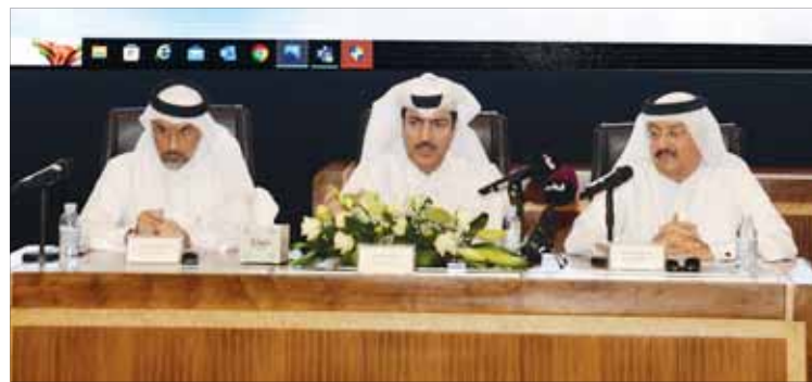
Officials at the press conference yesterday.