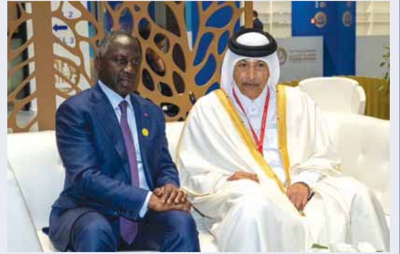
HE the Speaker of the Shura Council Hassan bin Abdullah al-Ghanem met with a number of speakers of parliaments, on the sidelines of the 146th assembly of the Inter-Parliamentary Union (IPU) in Bahrain. HE al-Ghanem met separately with Chairman of the Shura Council of Bahrain Ali bin Saleh al-Saleh, Speaker of the National Assembly of Cote d'Ivoire Adama Bictogo, and House of Peoples Representatives of Ethiopia Tagesse Chafo. The meetings discussed the existing co-operation between the Shura Council and Bahraini Shura Council, Cote d'Ivoire's National Assembly and Ethiopian House of Peoples Representatives, and ways to enhance it. The Shura Council members from the delegation participating in the work of the 146th IPU Assembly attended the meetings. (QNA)