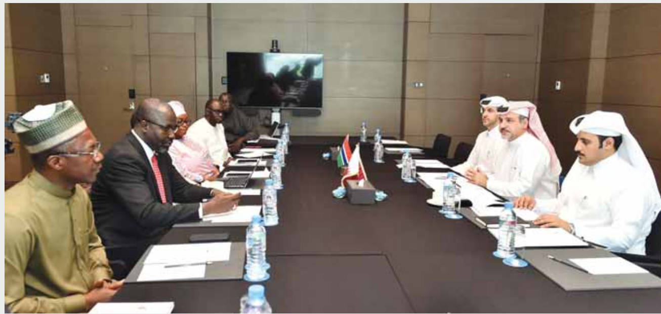
The joint technical committee between Qatar and Gambia has held a meeting on labour and manpower issues and the regulation of the employment of Gambian workers in Qatar, based on the labour agreement signed between the two countries. The two sides discussed ways to develop bilateral labour relations, and reviewed developments in the work environment in Qatar, in addition to strengthening and developing procedures for recruiting Gambian workers in the country, especially technical and specialised workers. (QNA)