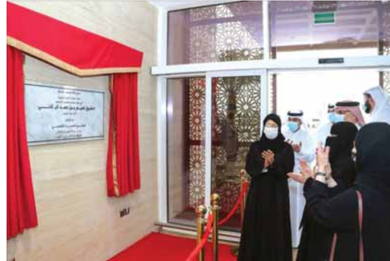
Minister of Health inaugurates New Al Sadd Health Center.

services have become more focused on healthy lifestyles and disease prevention, and seek to promote public health, within the framework of the health sector plans to shift care from a curative, hospital-based model to an enhanced one that provides preventive and health services in the community.