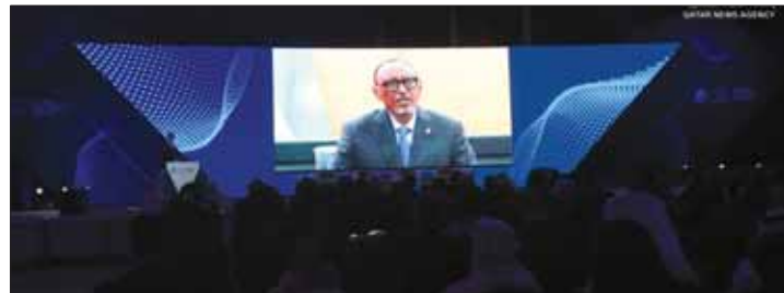
Paul Kagame addressing the forum.

He highlighted the development in his country and its capabilities in the field of health, raising economic growth rates and strengthening governance as well as fairness and equality for women.