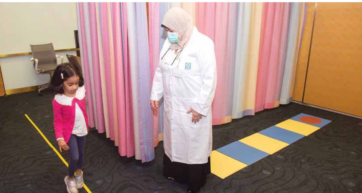
The study will inform researchers on potential interventions that can be implemented in clinical practice to improve children's readiness to school.