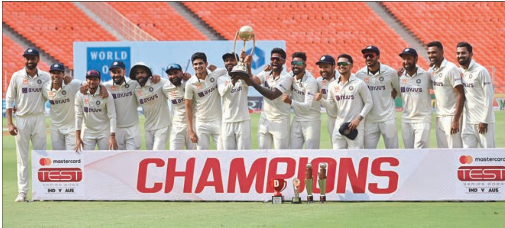
India's players pose with the trophy after winning the series at the end of the fourth and final Test against Australia at the Narendra Modi Stadium in Ahmedabad on Monday.

Virat Kohli won the Player of the Match award for his stunning 186 at Ahmedabad. Ashwin and Ravindra Jadeja were the joint-winners of the Player of the Series award. Both made crucial all-round contributions: Ashwin picked 25 wickets and scored 86 runs, while Jadeja picked 22 wickets and scored