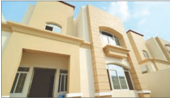
The municipality of Al Rayyan came at the top of the municipalities where the number of building permits issued was 156 in February this year.

In a quick review of the data on building permits issued during the month of February 2023, according to their geographical distribution, the municipality of Al Rayyan came at the top of the municipalities where the number of building permits issued was 156 permits, accounting for 24 percent of the total issued permits, while the