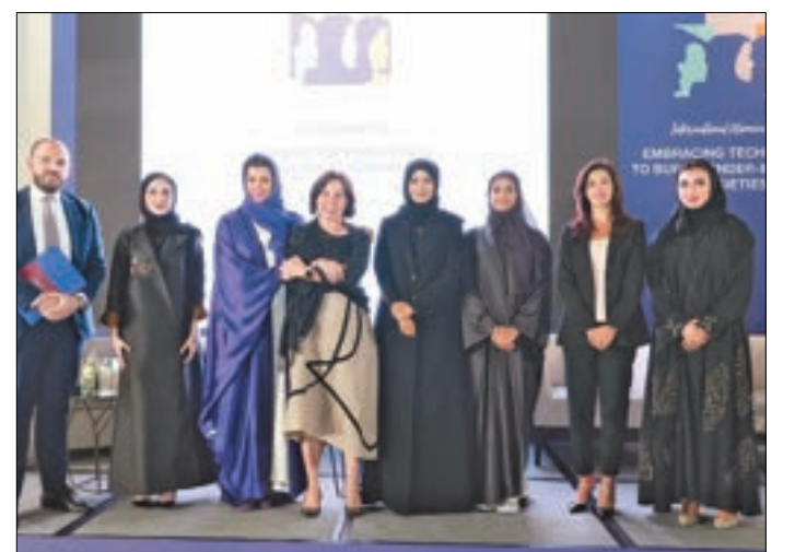
QFC, PWC and QBWA celebrating womens day

We strive to ensure that diversity is at the heart of what we do by providing the right opportunities and environment for our female colleagues to grow and become future leaders. Encouraging and recognising diversity and equality across the workplace is a measure of our own personal and professional success."