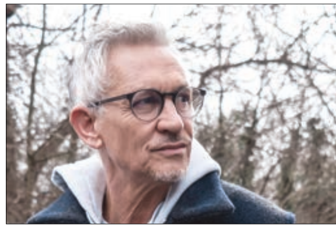
Gary Lineker, former England footballer turned sports TV presenter for the BBC, leaves his house, in London, on Monday. Gary Lineker will return as presenter of the flagship BBC football show Match of the Day, the broadcaster said.

In a short statement, Lineker said: "I am glad that we have found a way forward. I support this review and look forward to getting back on air."