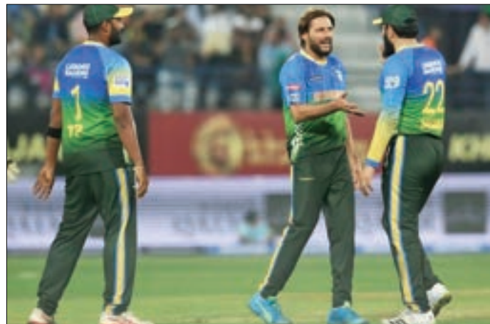
Misbah Ul Haq (right) celebrates their win with skipper Shahid Afridi.

for 3 in 10 overs. World Giants could muster only 64 for 5 in 10 overs despite