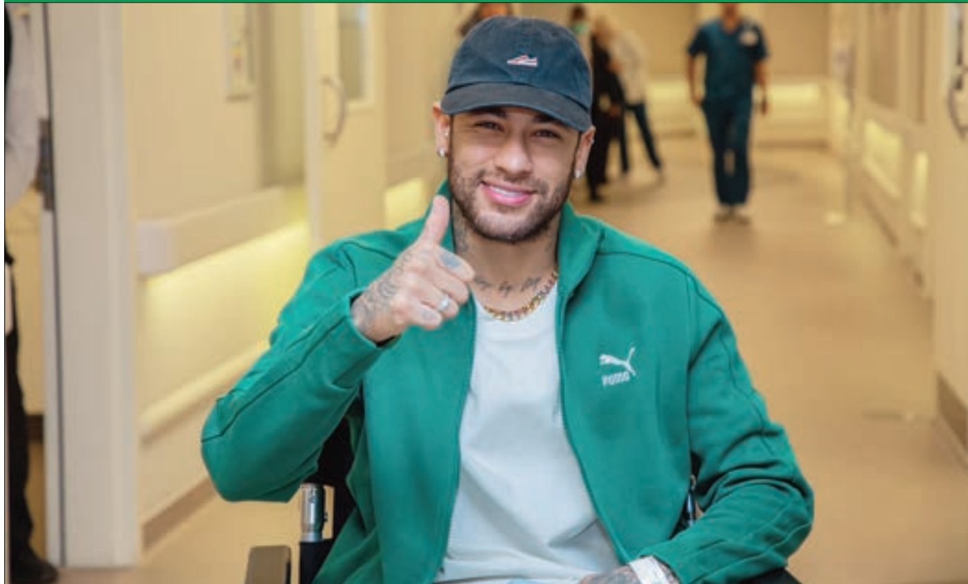
Brazilian football star and Paris Saint-Germain forward Neymar da Silva Santos Junior, has been discharged from Aspetar, orthopedic and sports medicine hospital on Sunday following a successful ankle surgery on Friday. Neymar will now take some time to recover before starting his rehabilitation programme.