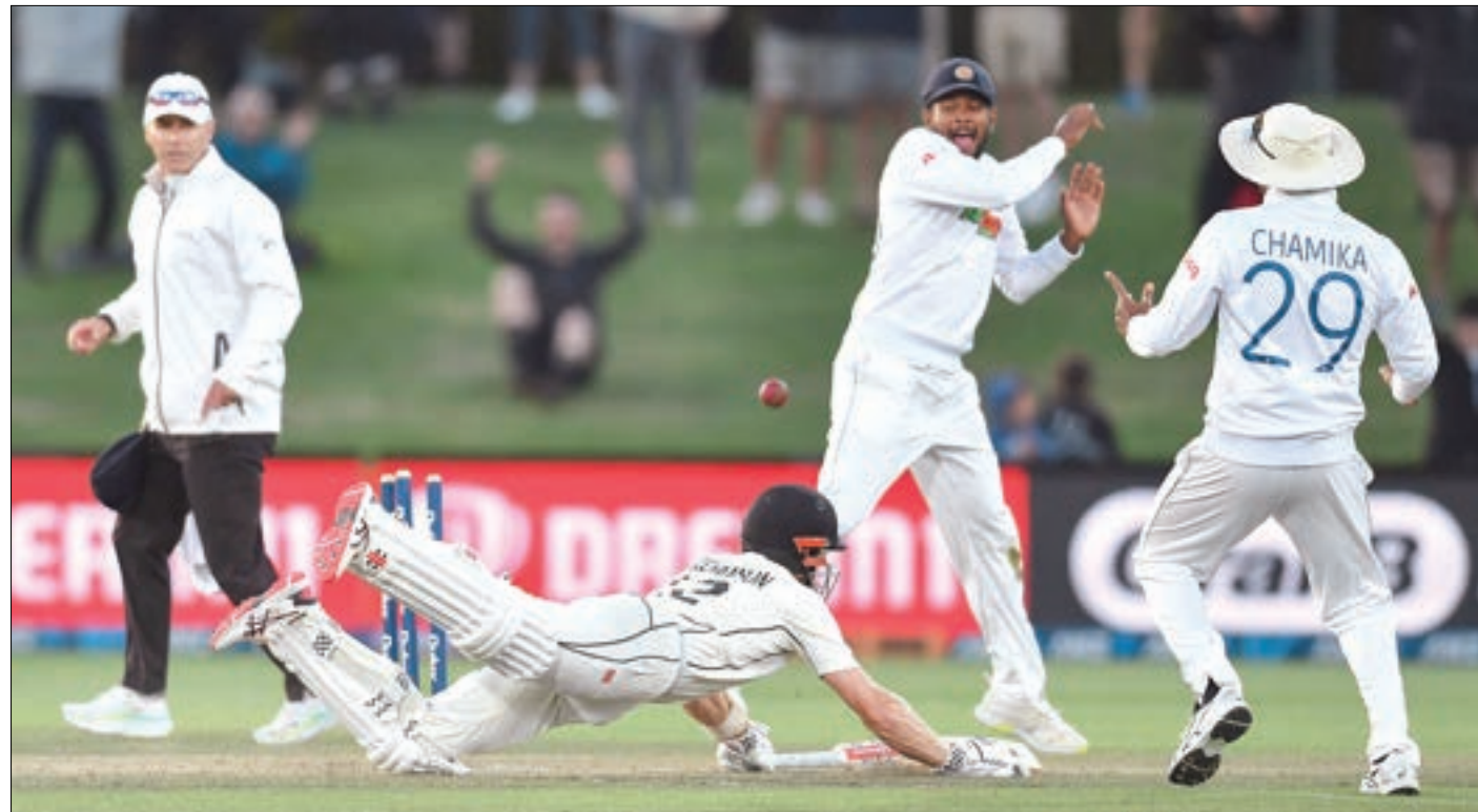
New Zealand's Kane Williamson (centre) makes a successful run to win the first Test against Sri Lanka at Hagley Oval in Christchurch on Monday.

Scores First Test, Christchurch, (day five) Sri Lanka 355 (Southee 5-64) & 302 (Mathews 115) New Zealand 373 (Mitchell 102) & 285-8 (Williamson 121*) New Zealand won by 2 wickets.