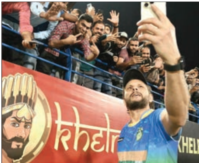
Asia Lions skipper Shahid Afridi obliges fans with a selfie at the Asian Town International Stadium on Monday evening.

Tillakaratne Dilshan's unbeaten 32 off 24 balls (3x4s; 1x6) saw the Asian Lions posted 99