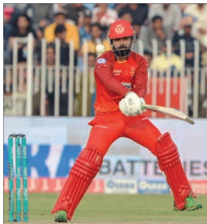
Islamabad United's Shadab Khan plays a shot during the Pakistan Super League (PSL) Twenty20 match against Peshawar Zalmi at the Rawalpindi Cricket Stadium, in Rawalpindi on Sunday.