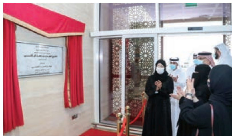
Minister of Public Health HE Dr Hanan Mohammed Al Kuwari during the inauguration of Al Sadd Health Center on Monday.

In a statement, Dr Al Kuwari affirmed that the expansion of primary health care centres in various regions of the country comes within the framework of serious work to ensure that all residents have access to high-quality and integrated health services, and at the right time and place, in order to achieve the goal (A Healthy Population: Physically and Mentally) in Qatar National Vision 2030 and in the health strategy. She added that primary health