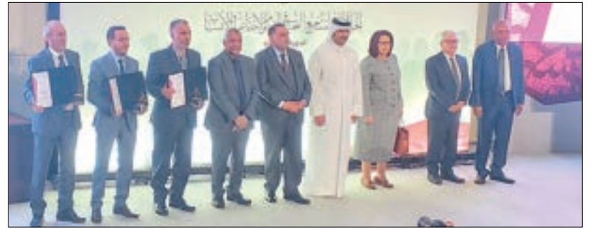
DOHA