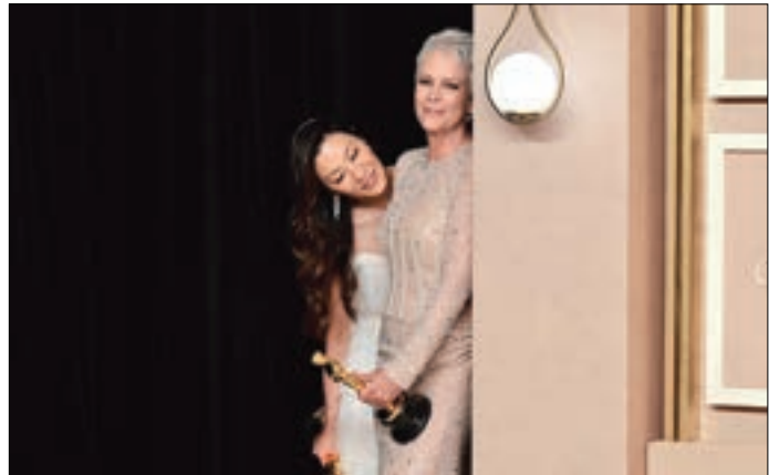
Michelle Yeoh and co-star Jamie Lee Curtis.

The actress, who is the daughter of Hollywood stalwarts Janet Leigh and Tony Curtis, added: "And my mother and father were both nominated for Oscars in different categories, I just won an Oscar."