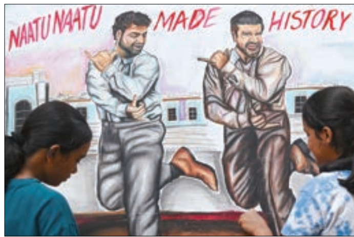
Art school students give final touches to a painting of Indian actors N.T. Rama Rao Jr. (L) and Ram Charan of Indian movie "RRR", along a street in Mumbai on Monday.