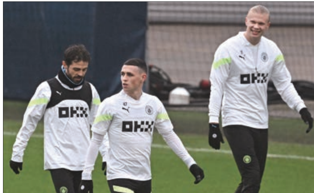
(From left) Manchester City's Portuguese midfielder Bernardo Silva, Manchester City's English midfielder Phil Foden and Manchester City's Norwegian striker Erling Haaland attend a team training session at Manchester City training ground in Manchester on Monday.

more prolific [before] when he got the chances but I don't think we need to complain about Erling's output.