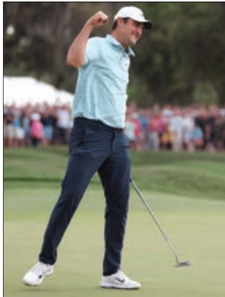
Scottie Scheffler of US celebrates after making his putt to win on the 18th green during the final round of The Players Championship at TPC Sawgrass in Ponte Vedra Beach, Florida, on Sunday.